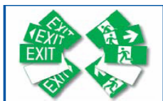
1. Pick the correct decal

One box is all you will ever need regardless of what standard you require! Each of our "ONE BOX: both standards" exits comes with all the "EXIT" and "Pictograph" inserts all in the box. One exit, one part number, one price, just open the box and PICK, SLIP AND CLIP.