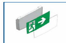
3. Clip it shut