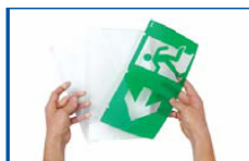
2. Slip it in