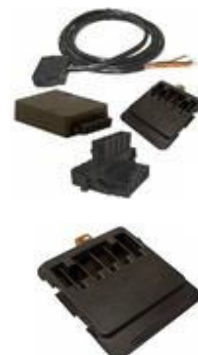
Industry Standard Connections