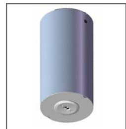
Surface mounted cylinder LIFELIGHT Diameter 127 (mm) x 252 Long