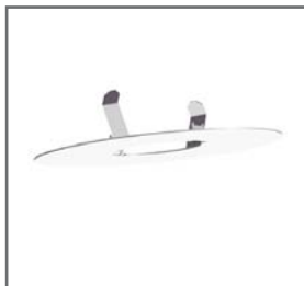
Retro-fit adaptor plates available for existing small and large hole cut-outs